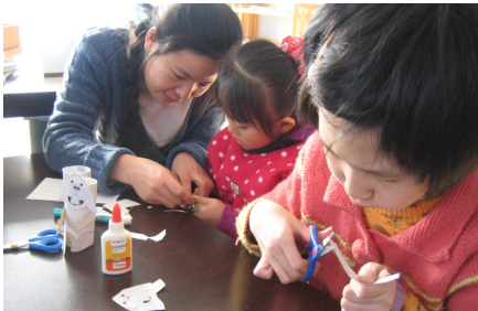
Morning Light centre for special needs children

The majority of my time was spent talking with these workers and praying with them. Alongside this I preached at the Sunday meeting for company workers and taught a module at ASM for the 8 students which was entitled, "How to Read the Bible for all its Worth". This involved 11 hours of teaching a brief overview of the Bible and considering how to interpret the different types of literature it contains. The course was very well received.