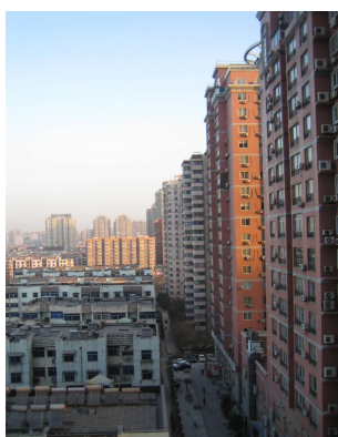
View from my apartment – usually you can't see beyond the second building because of the poor air quality

Secondly, I heard a story from people working among Tibetans. The Tibetan people group have been very difficult to reach with the gospel, and Tibetan Buddhism has an extremely strong hold upon them. It isn't just their religion but involves their way of life, culture and identity. Hudson Taylor said in the 19 th century, "It's easier to take a cub from a tiger than to convert a Tibetan to Christ". Many consider this to be true today. However, reports from one of the 5/6 Tibetan monastery towns describe how one of the senior lamas (a lama is the name of their spiritual leaders) met with 2 other senior lamas for a day of contemplation and discussion. This is quite common. But on this particular occasion it is understood that he took a Bible with him into that meeting and all three were profoundly affected by what they read. Please pray for this people group. Many recently have felt that an openness to the gospel will begin with the Tibetan spiritual leaders, and have been particularly praying for this to happen.