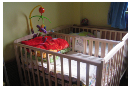
Cots at Doves Wings bought with money donated by members at OBF

As always, I received more than I imparted during the trip. There were a couple of things that people in the organisation shared with me that remind us of the need to continue in prayer for this great country of China. The first was concerning the 3 rd Lausanne Convention for World Evangelisation that took place in South Africa in October. I knew that some Chinese House Church leaders were planning to attend this conference (I've been told that up to 200 had hoped to go), however none made it. They were prevented from travelling by the authorities. It is thought that this clamp down was linked to the fact that no-one from the Three Self Church had been invited, though it may still have happened even if they had been. We need to remember our brothers and sisters, particular those in leadership, and continue to pray for them. Many (not all) enjoy more freedom than in the past, but they still face many challenges.