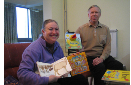
Books donated by children at OBF

I visited 2 cities and spent time with 17 CCSM workers. These people are involved in a variety of situations. Several are students at ASM (for more info please look at CCSM's website – they still need a couple more students for next year's ASM if you are interested), some are studying, some are helping to run Doves Wings (the new orphanage for babies). Another couple are helping at Morning Light (a day centre for children with severe physical handicaps) as well as supporting the work in a wing of an orphanage for special children, some help run ASM, one person oversees a sponsorship programme paying for the education of children in poor families (I think there are around 80 children in the scheme – if anyone is interested in further details about this please let me know and I can direct you to the website), another person has been involved in offering some medical support to victims of last year's earthquake, some are helping at a school in a very poor rural region and others are involved in support for the local house church.