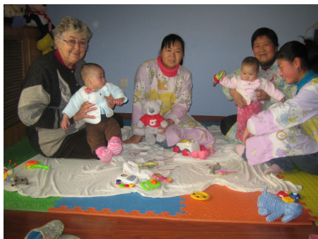
Doves Wings orphanage with toys donated by children at OBF

There were several. It was great to visit both Morning Light and Doves Wings for the first time. The Doves Wings trip was very brief and the babies were having an afternoon nap, but it was still worthwhile so as to understand a little bit more about the orphanage. At the Morning Light centre I spent an afternoon helping the children with their activities. It was also good to meet many of the staff who are Chinese believers.